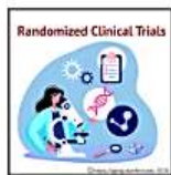
Randomized Clinical Trials