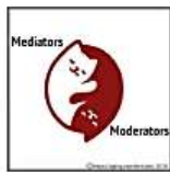
Mediators And Moderators