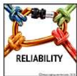
Validity and Reliability