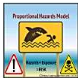
Proportional Hazards Model